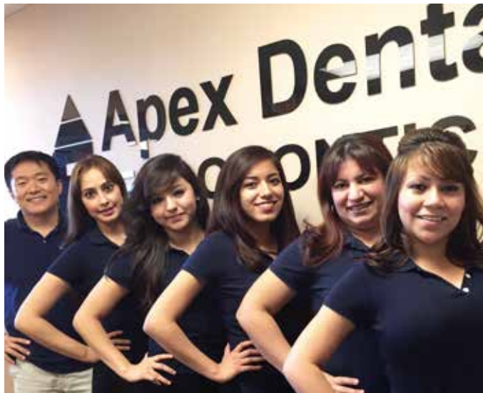
PrimeTime Holiday Traditions 08