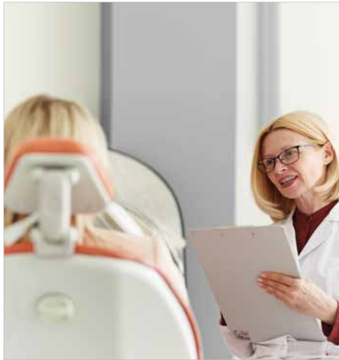
C. Difficile 04