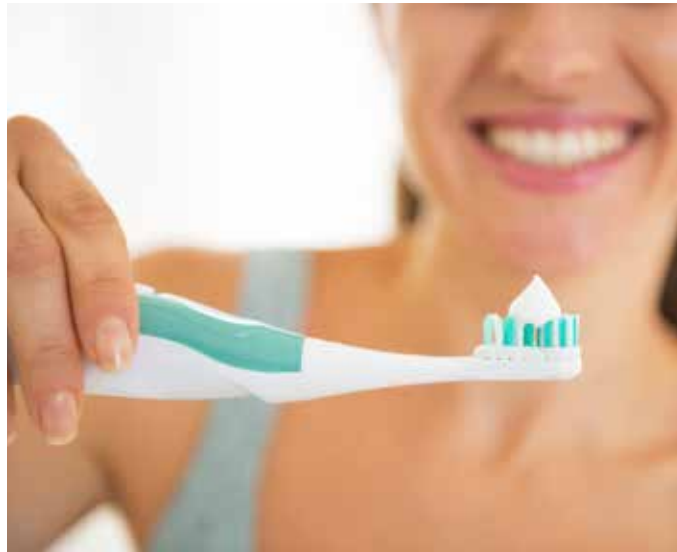
Electric Toothbrushes 07