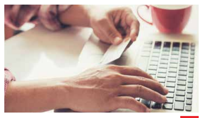
By The Way