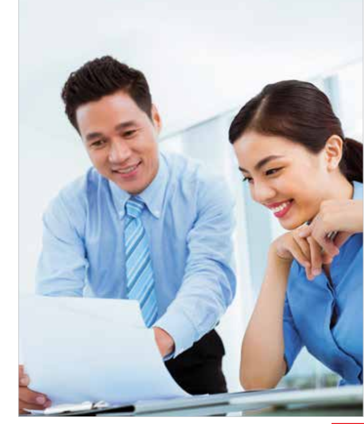
Are You Ready for Diagnostic Terminology? 09