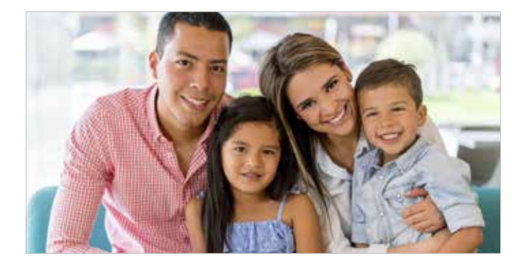
Combatting Dental Caries